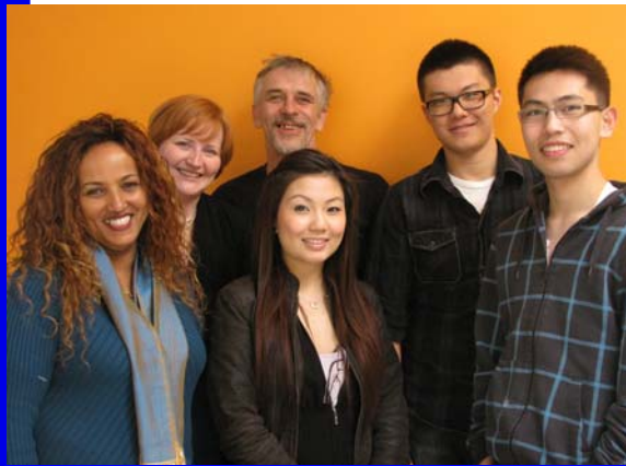
SIFE Business Planning Project with local entrepreneurs, students, and Storefront staff