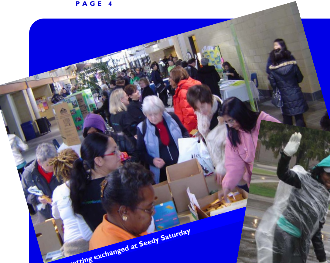
Seeds getting exchanged at Seedy Saturday