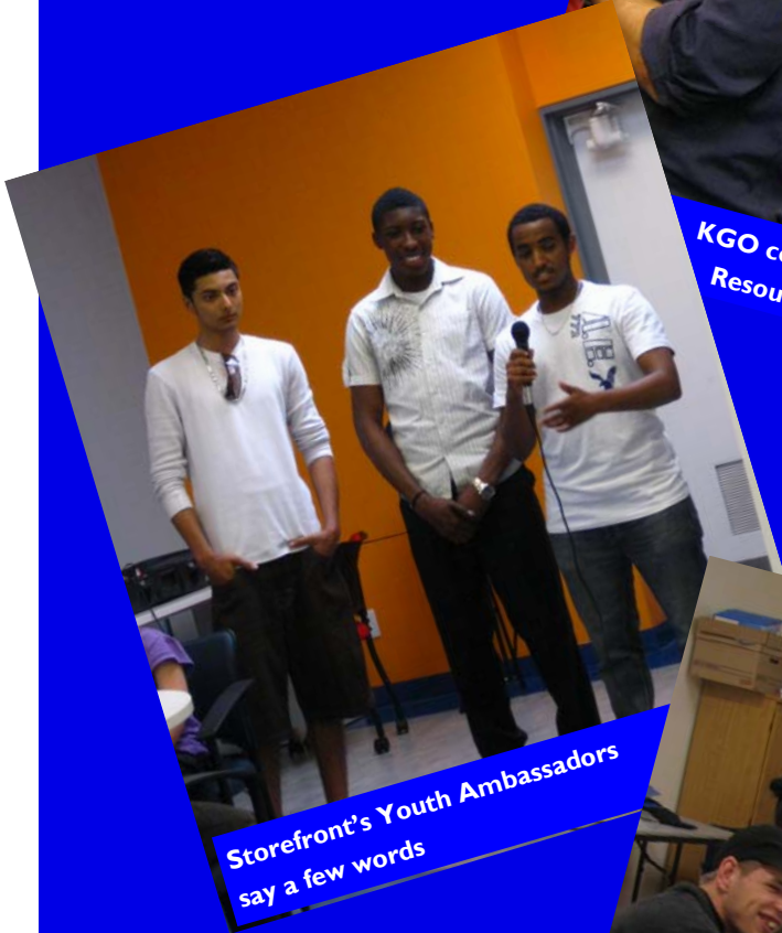
Storefront's Youth Ambassadors say a few words