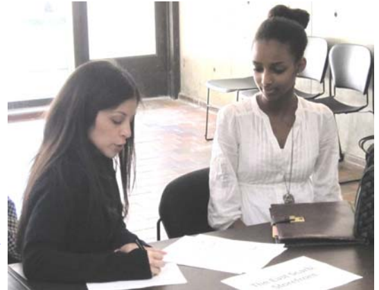
Youth Career Fair at University of Toronto, Scarborough Campus