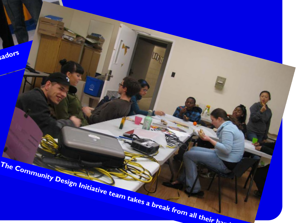
The Community Design Initiative team takes a break from all their hard work.