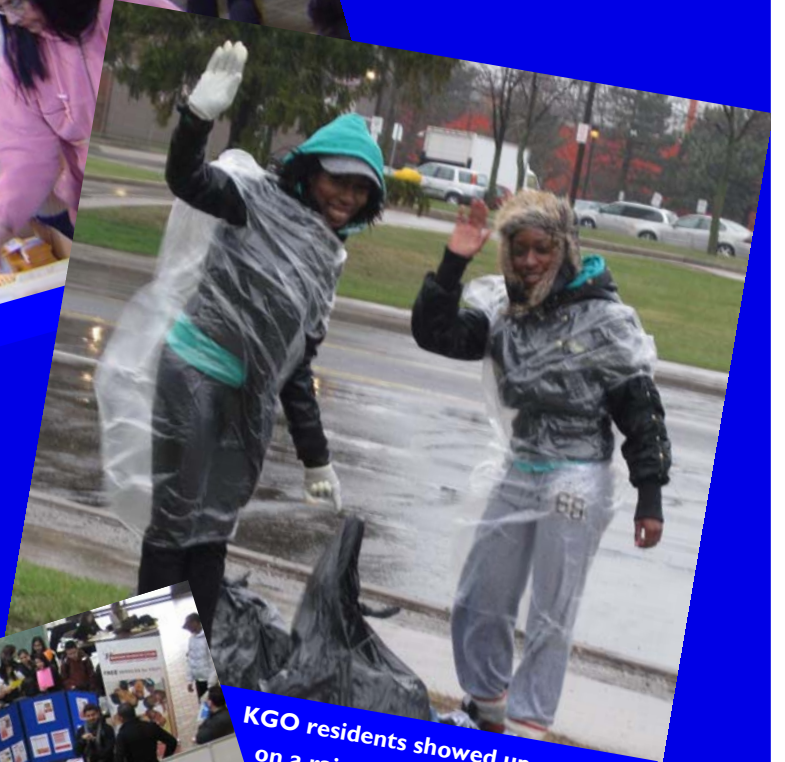
KGO residents showed up en masse on a rainy Community Clean-Up Day